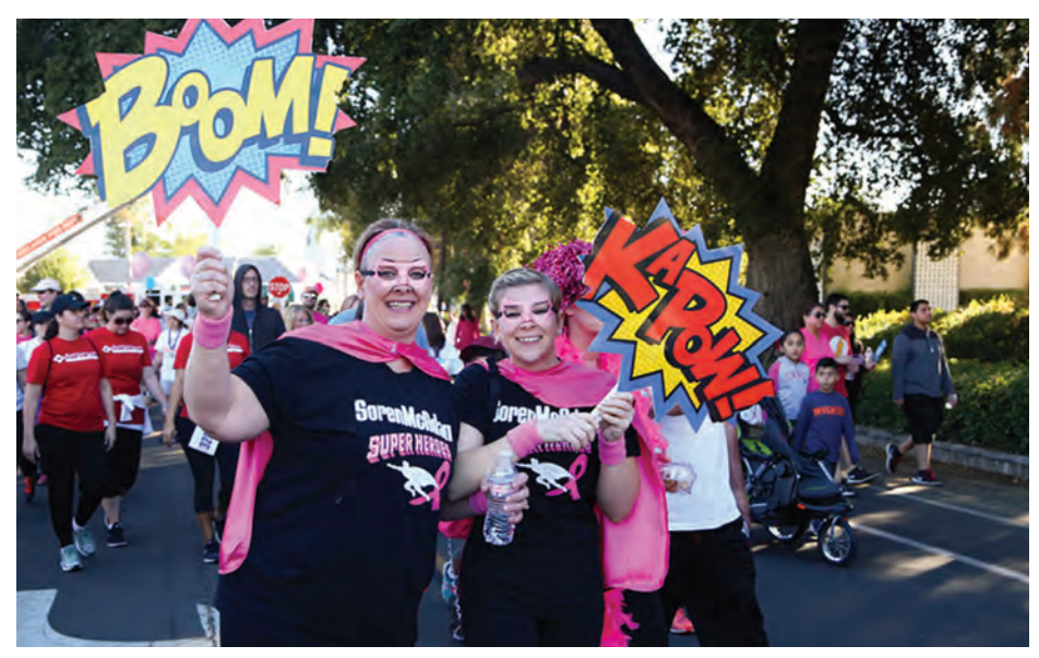
BOOM! KAPOW! These two superheroes are ready to fight cancer at the 9th annual Believe Walk in Redlands.