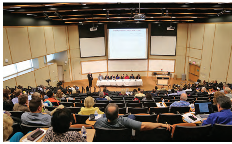
More than 200 attendees gathered together to explore Loma Linda University Health on September 22.

exploring the philosophical roots of Loma Linda University's beliefs, the institution will be able to apply them to the desire to grow.