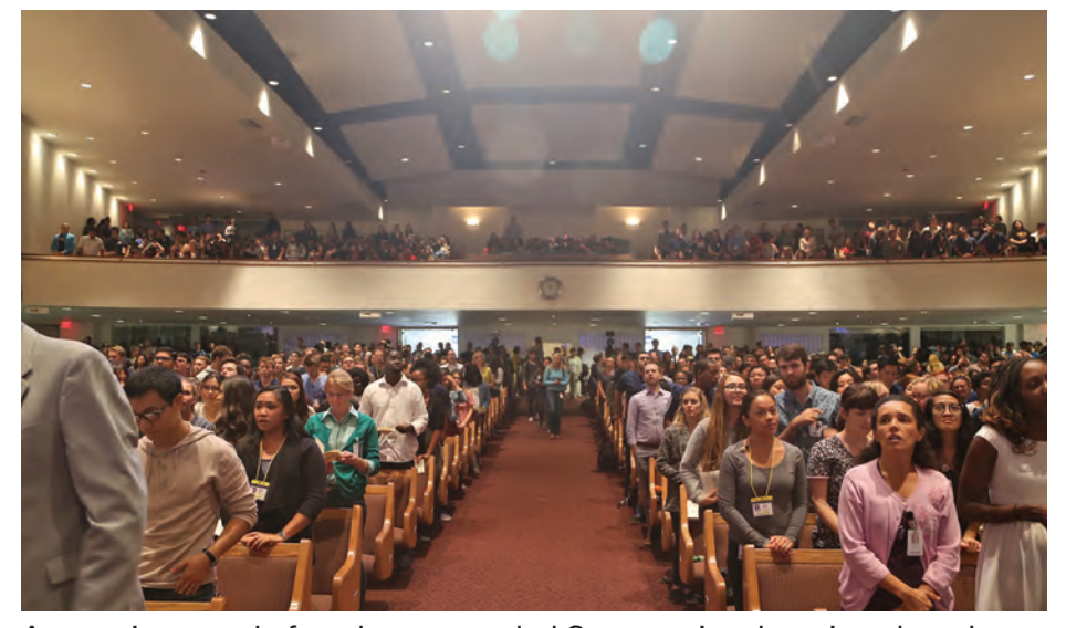
A capacity crowd of students attended Convocation, learning about Loma Linda University Health's calling and commitment to heal a hurting world. For more photos, see gallery below the story.