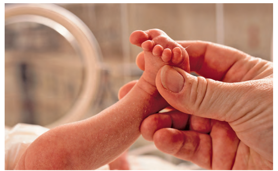
Babies born pre-term and their parents experience a multitude of feelings unique to their situation—far different than a normal delivery.

The daylong conference, held at Wong Kerlee International Conference Center, was attended by close to 100 individuals-many of them nurseswho listened to a wide range of topics