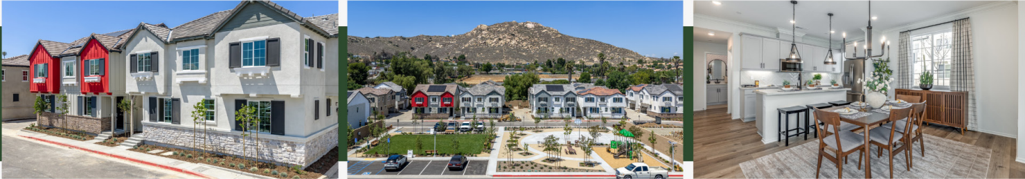
*The builder incentive is applied toward a 2-1 temporary buydown with rates starting at 3.99% for Year 1, 4.99% for Year 2 and 5.99% for Years 3-30. APR 6.023%. The promotion is for Lot 25 with a purchase price of $599,990. Example assumes a 3.5% down payment ($21,000) and a loan amount of $589,122 on a 30-year fixed rate FHA loan. Upfront mortgage insurance premium is included in the loan amount. Year 1: 3.99% (P&I: $2,809/month) Year 2: 4.99% (P&I: $3,159/month) Years 3-30: 5.99% (P&I: $3,628/month) Monthly payments reflect principal and interest only. Property taxes, homeowner's insurance, mortgage insurance, and homeowner association dues are not included and will increase the total monthly payment. Financing is offered by Secured Choice Lending (SCL), Branch NMLS #1889518. All loans are subject to credit approval, underwriting guidelines, market conditions, and availability. Not all borrowers will qualify, and rates may vary based on credit profile. Buyer is not required to use SCL to purchase a home; however, use of SCL is required to obtain the advertised rate and incentive. Additional closing costs apply. Restrictions may apply. This is not a commitment to lend. Terms subject to change without notice. Images are for illustrative purposes only. Equal Housing Opportunity. P&I - Principal and Interest. APR - Annual Percentage Rate. Grand Pointe Real Estate, CA DRE #02131080.

www.rchobbs.com/las-palmas | 951-481-1765