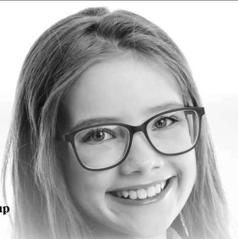
Schedule an appointment now to get seen by the end of the year!