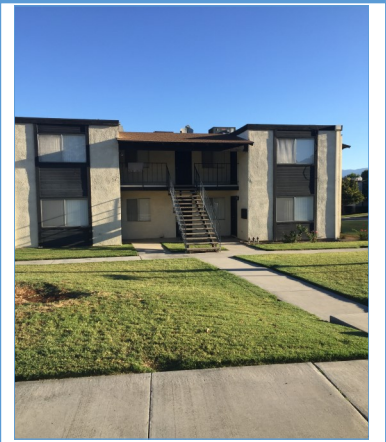
TWO BEDROOM, one bath nicely maintained. Washer and dryer onsite. Walking distance to LLUMC. Available September, $1,925.00 monthly. No pets allowed. (951) 733-0741.

FOR RENT! Four bedroom, 2.5 bath 11648 Caldy Ave. Loma Linda $3,600.00. Two bedroom, two bath Grand Terrace $2,300.00. Four bedroom, 2.5 bath Lawton