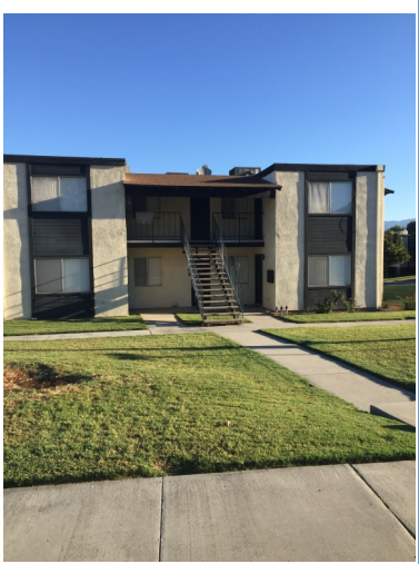
TWO BEDROOM, one bath nicely maintained upstairs apartment. Washer and dryer onsite. Walking distance to LLUMC. $1,925.00 monthly. No pets allowed. (951) 733-0741.

distance to LLU and VA hospital. Close to the freeway, shops, and restaurants. $920.00 monthly with deposit. At least one-year lease for qualified renters. <res72_00@yahoo.com> (661) 312-0128. May17